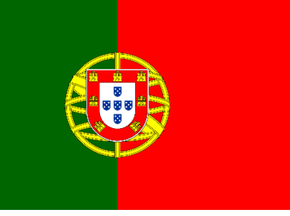
Moving our production to Portugal