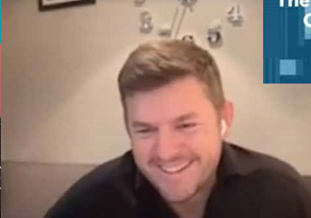
Interview on Financial Stockholm