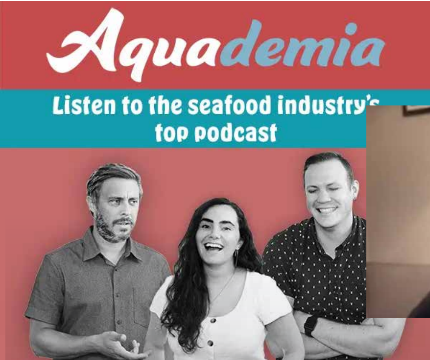
Interview on the Aquademia podcast

We work actively to participate in the media and at conferences to share information about our product and our plans for the future. It is much easier now compared to during the pandemic! Here are some activities from last two months: