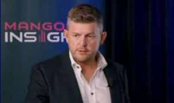
Presentation at the investor day at Mangold in Stockholm